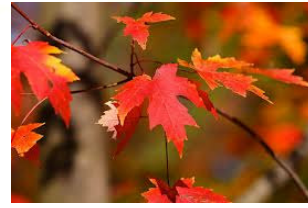
Leaves Are Falling Down