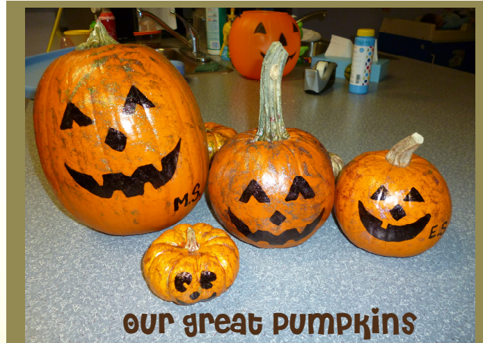
our great pumpkins

♥ Roll over: To get the little elephants moving... we placed the little pumpkins on the floor and encouraged the babies to reach and roll towards them!