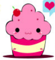
The muffin Man

Oh; do you know the muffin man The muffin man, +5he muffin ma Oh; do you know the muffin man That lives on Drury lane?