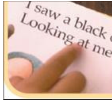
Reading from Left to Right